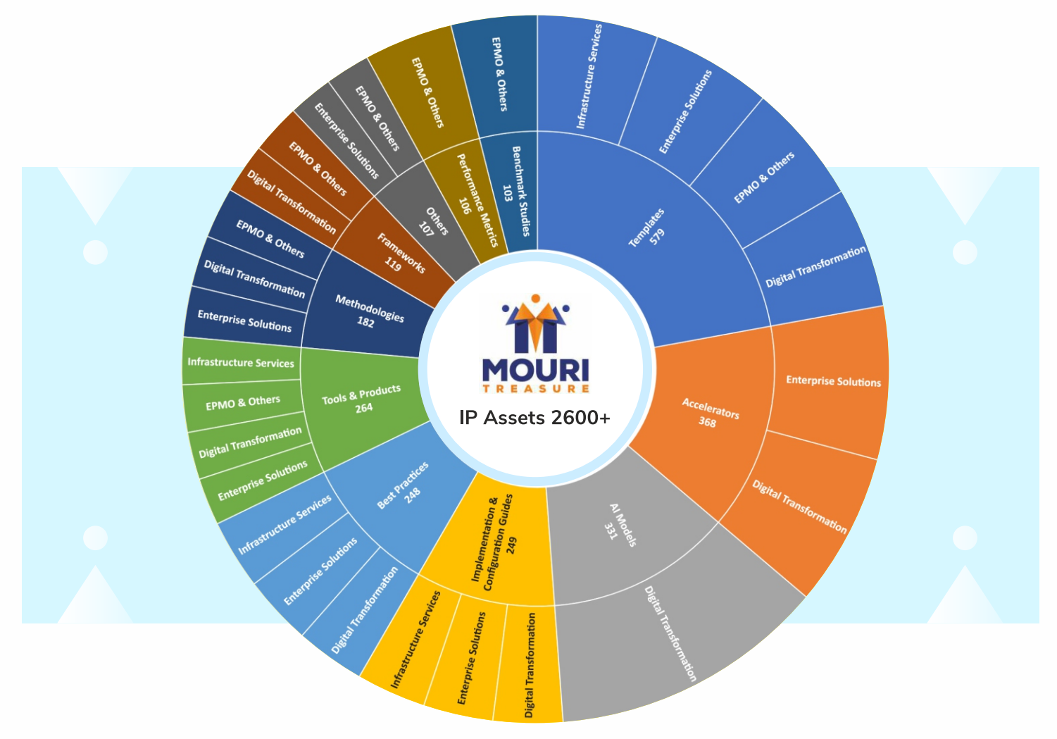
12 Ways Our 'IP Assets' Accelerates Sustainable Growth